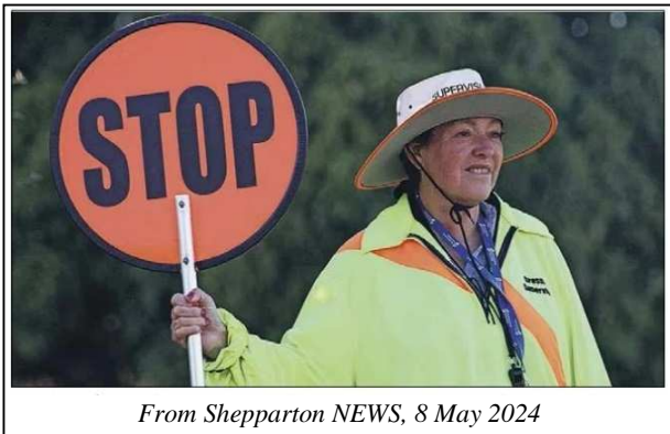
From Shepparton NEWS, 8 May 2024