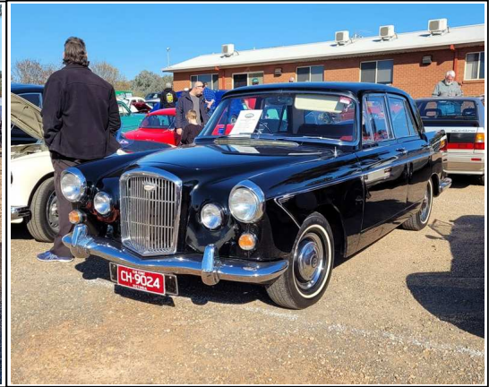
1959 WOLSELEY 6/99 sedan 1967 RILEY Kestrel S 1300 sedan