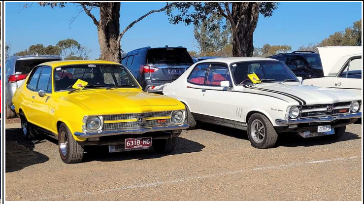
HOLDEN LC Toranas – 1970 GTR XU-1, 1969 GTR sedan 1974 LEYLAND P76 sedan