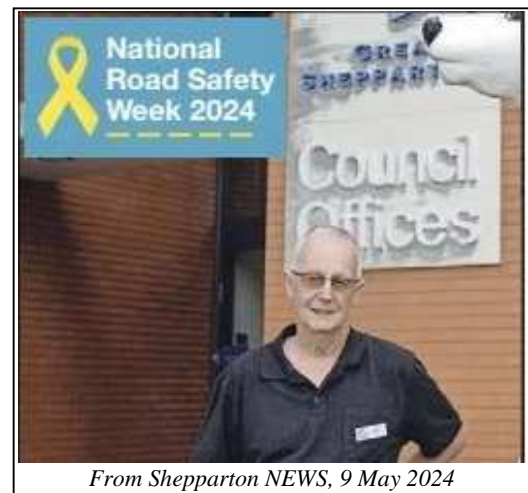
From Shepparton NEWS, 9 May 2024