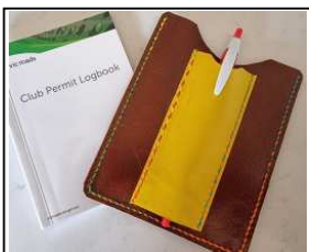
Log book covers (with pen holder)

- Hand stitched leather, in a variety of colours. Member price $10 . Contact Peter Borthwick ☎ 0490-429 819