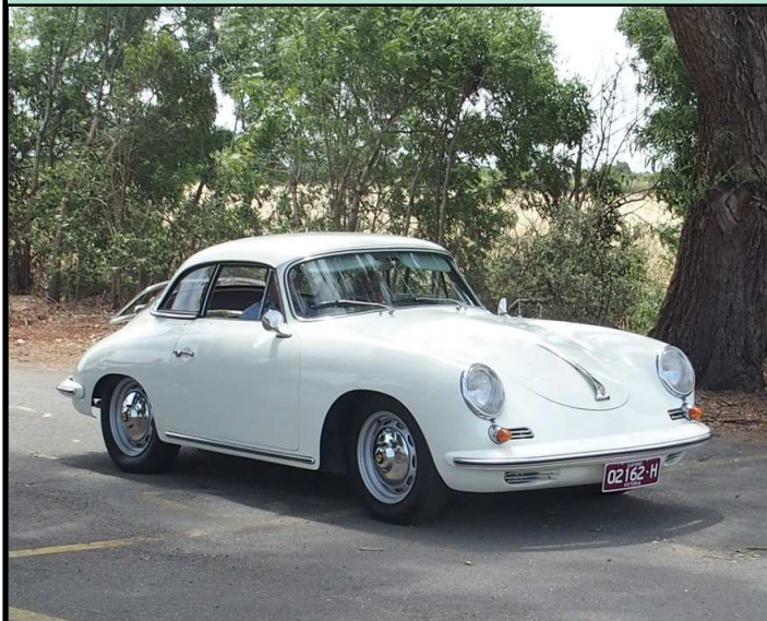
1960 PORSCHE 356B 1600 Super cabriolet Brian and Faye Briggs