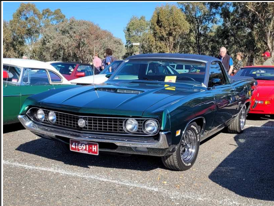
1970 FORD Ranchero GT utility 1974 HOLDEN HQ Sandman panel van